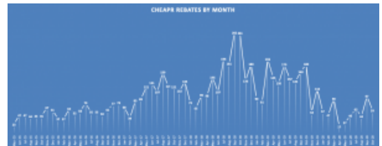
CHEAPR Rebate History

We have been closely following the CHEAPR saga, the year-long and still unresolved effort to revise program parameters, and have been publishing monthly program status from the CHEAPR dataset. It is anticipated that the board will vote on this reasonably soon.