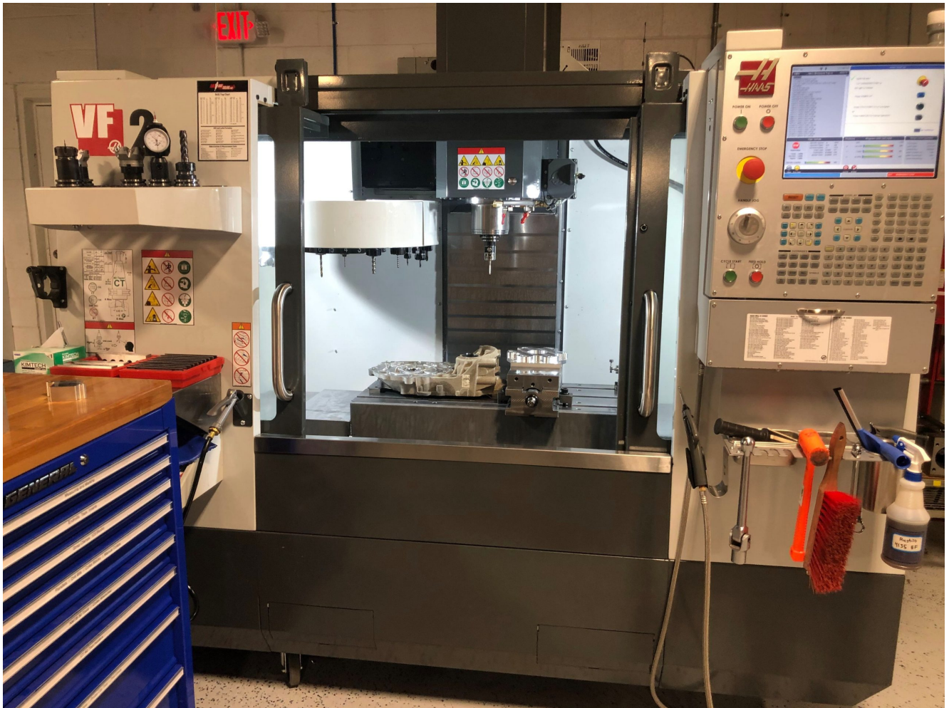
The CNC machine at Inductive Autoworks used to design and machine parts for custom EV conversions.

Custom parts are designed on a computer and fabricated in house on the CNC (Computer Numerical Control) machine, thereby ensuring accuracy and consistency while ruling out human inefficiency and error. The next time they have to machine the same part, they call up the design and reuse it at marginal expense to the customer.