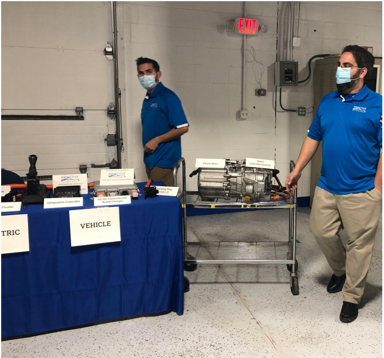
Electric motor and controller/inverter on cart