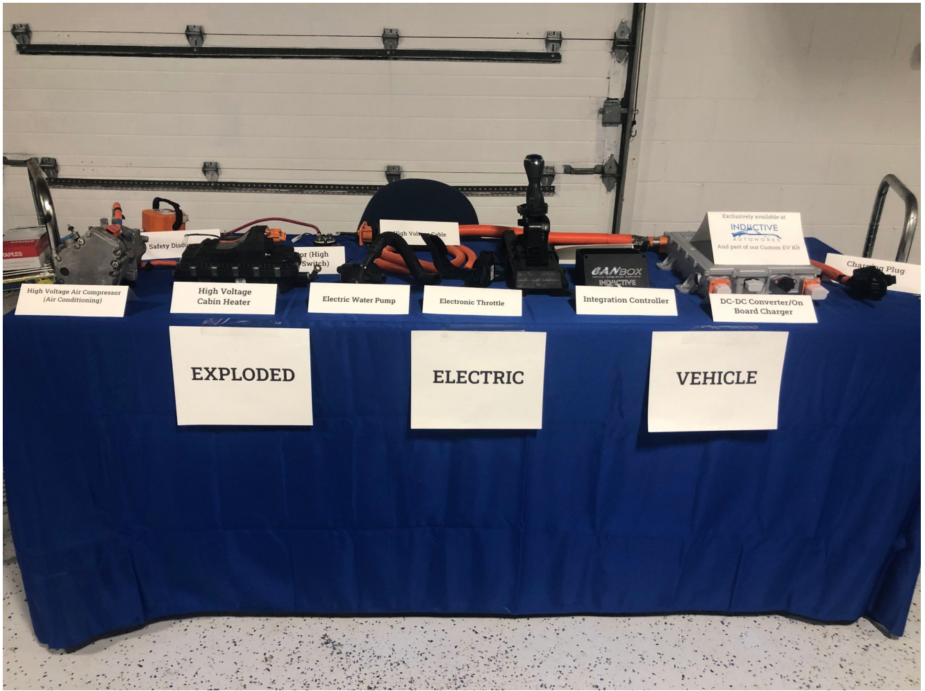
Inductive Autoworks Exploded Electric Vehicle display