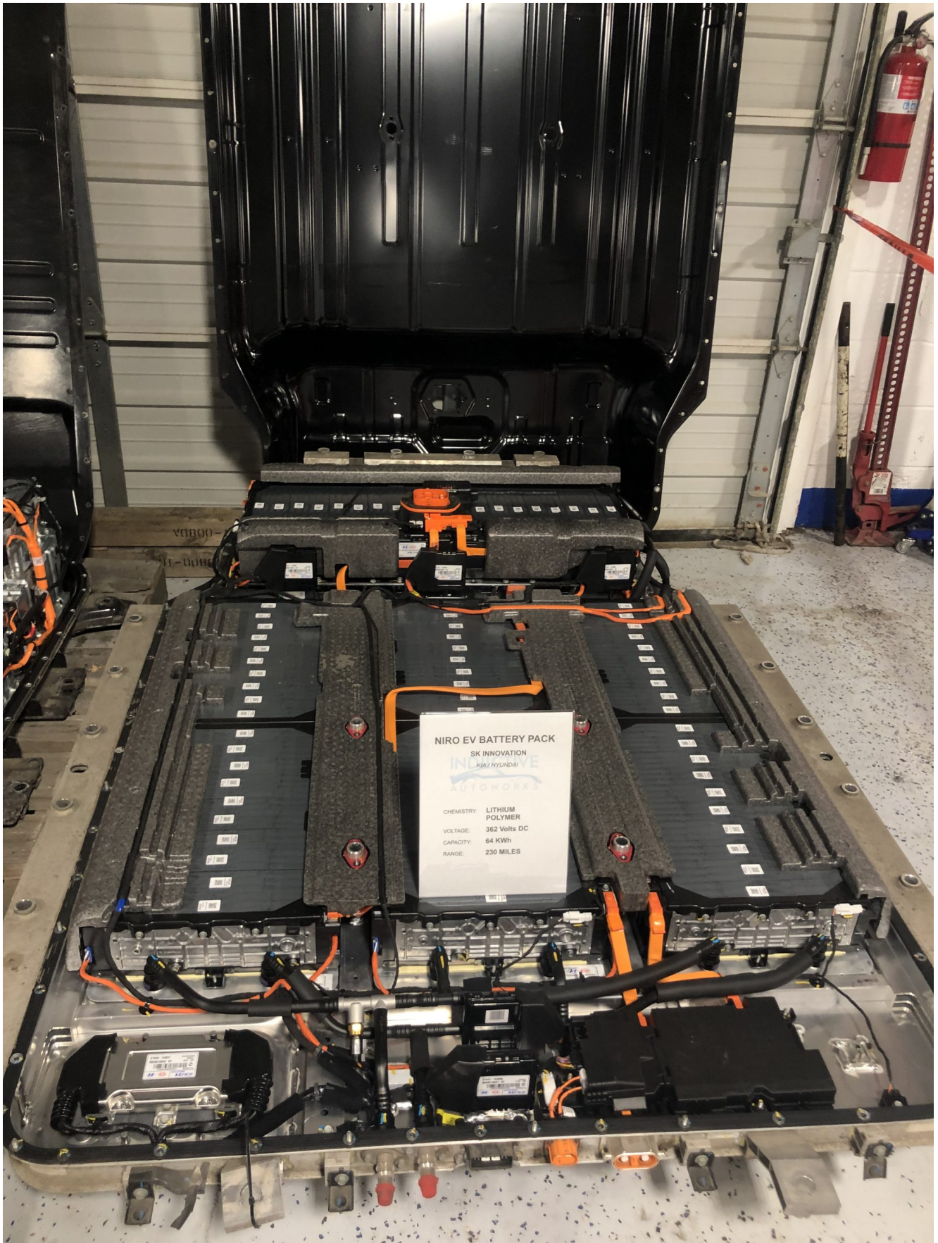
Niro EV Battery Pack at Inductive Autoworks

Step 2, better yet phase 2, is to add all the EV components and connect them. EV conversions are custom engineered, take