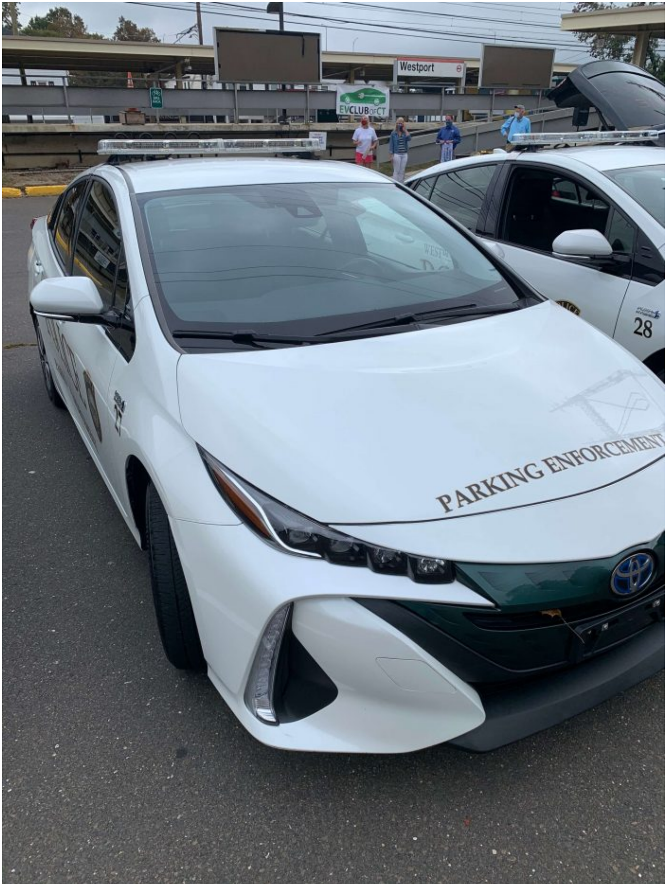
Plug-in Prius Prime Westport Parking Enforcement Vehicle

This Toyota Prius Prime, a plug-in hybrid, is one of four plug-in vehicles currently in use by the Westport Police and