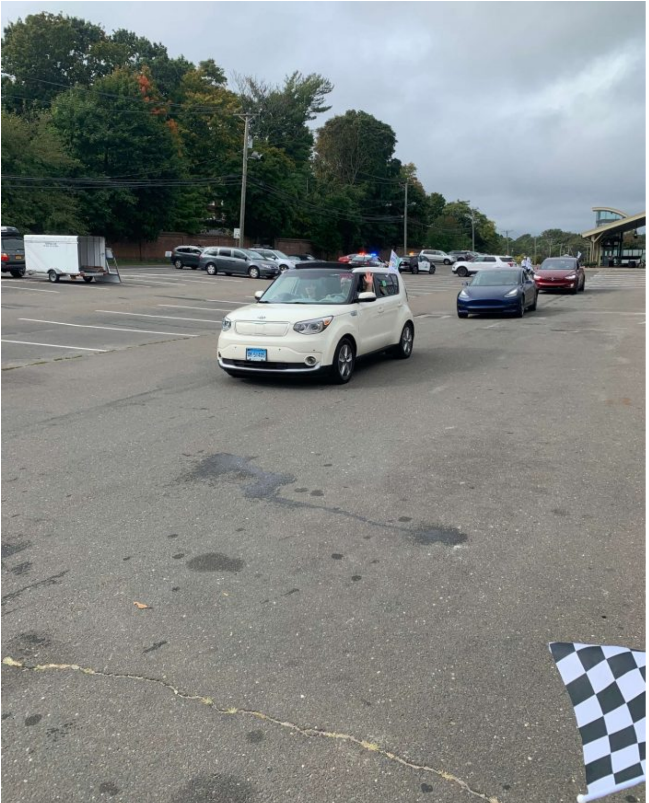
Kia Soul EV