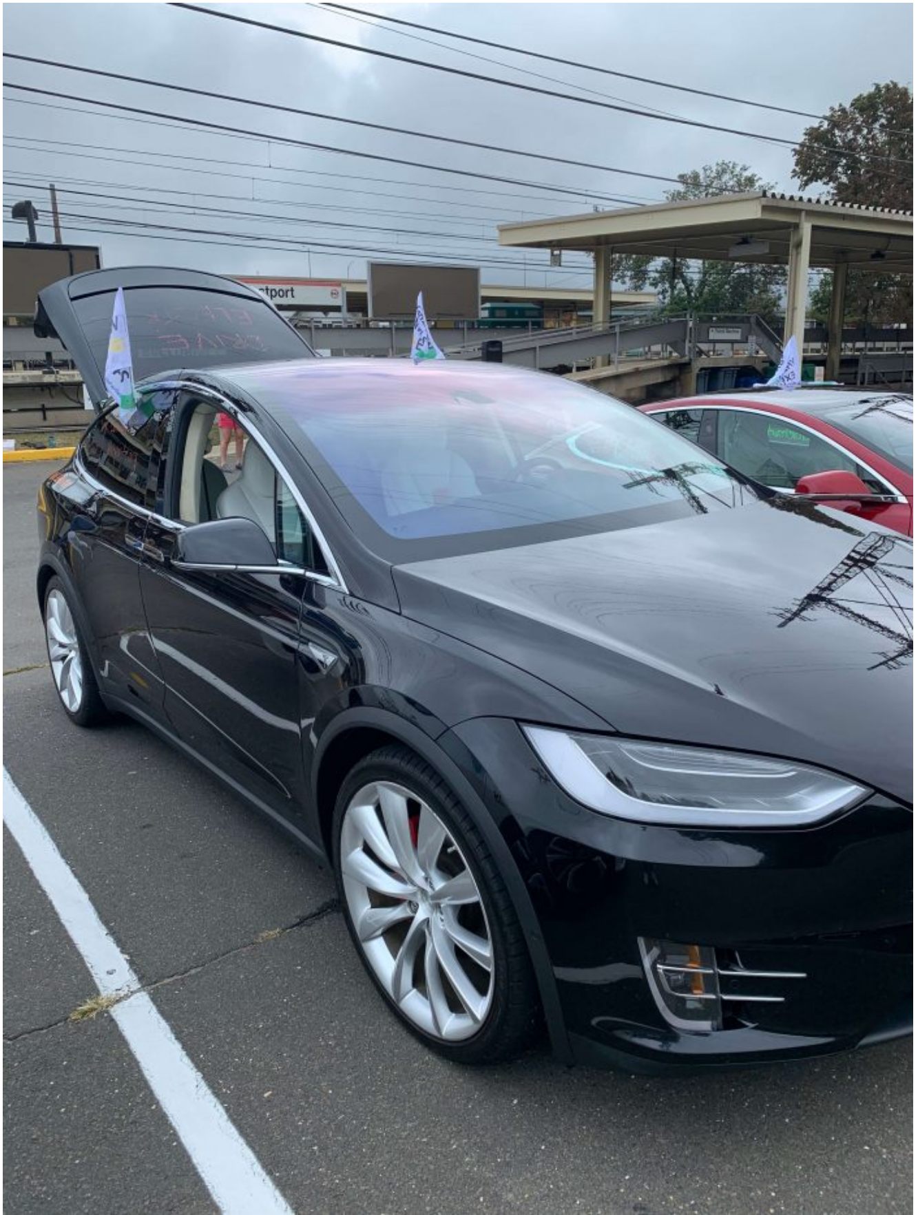
Tesla Model Y