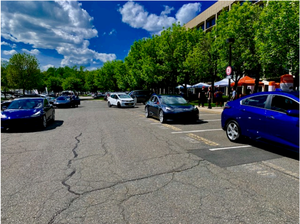
Rider Changeover Lane