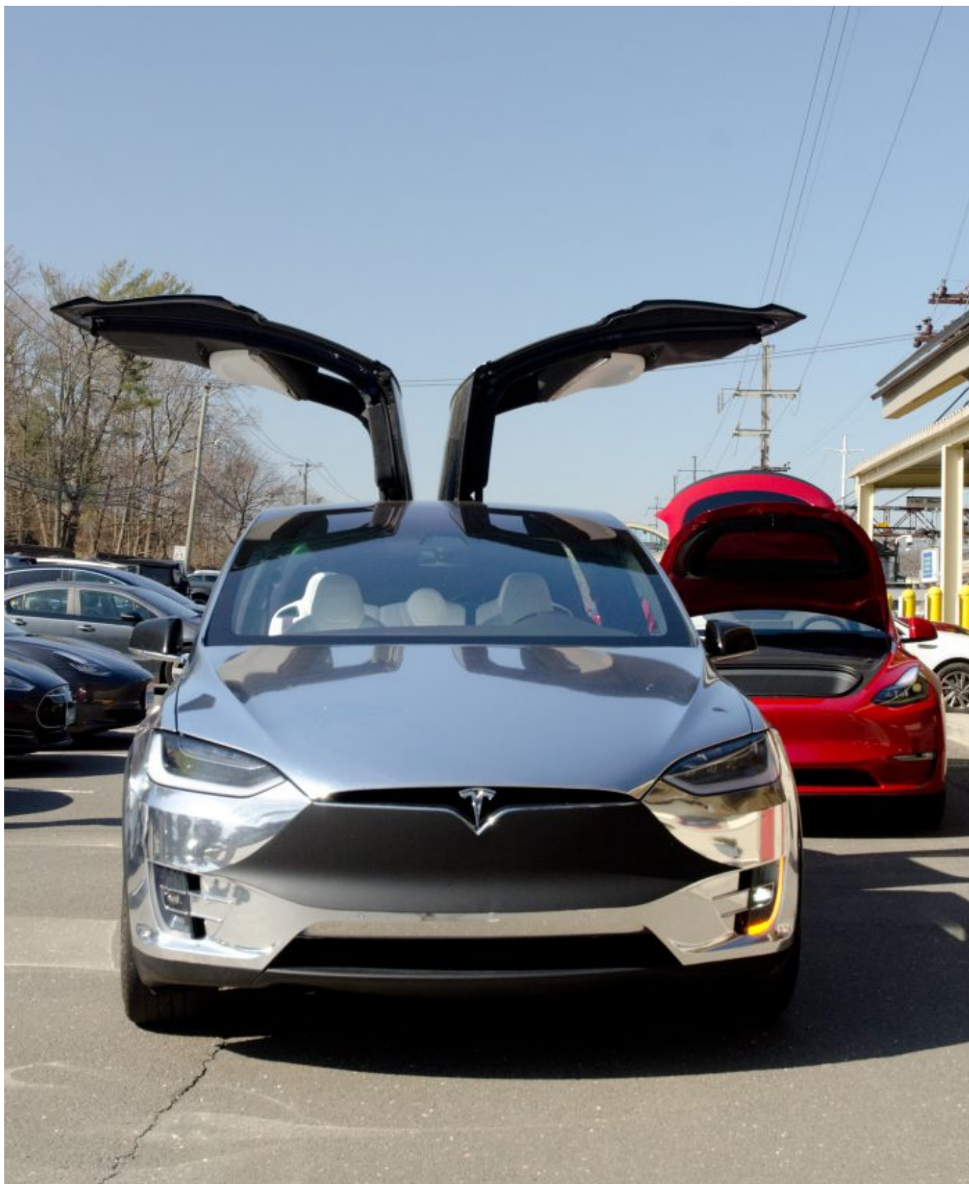
Tesla Model X in chrome wrap. Model Y on the right.