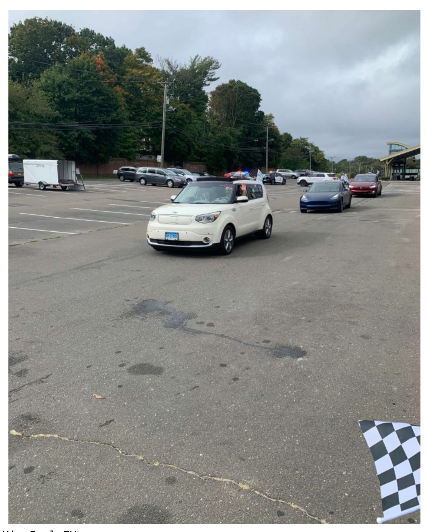
Kia Soul EV