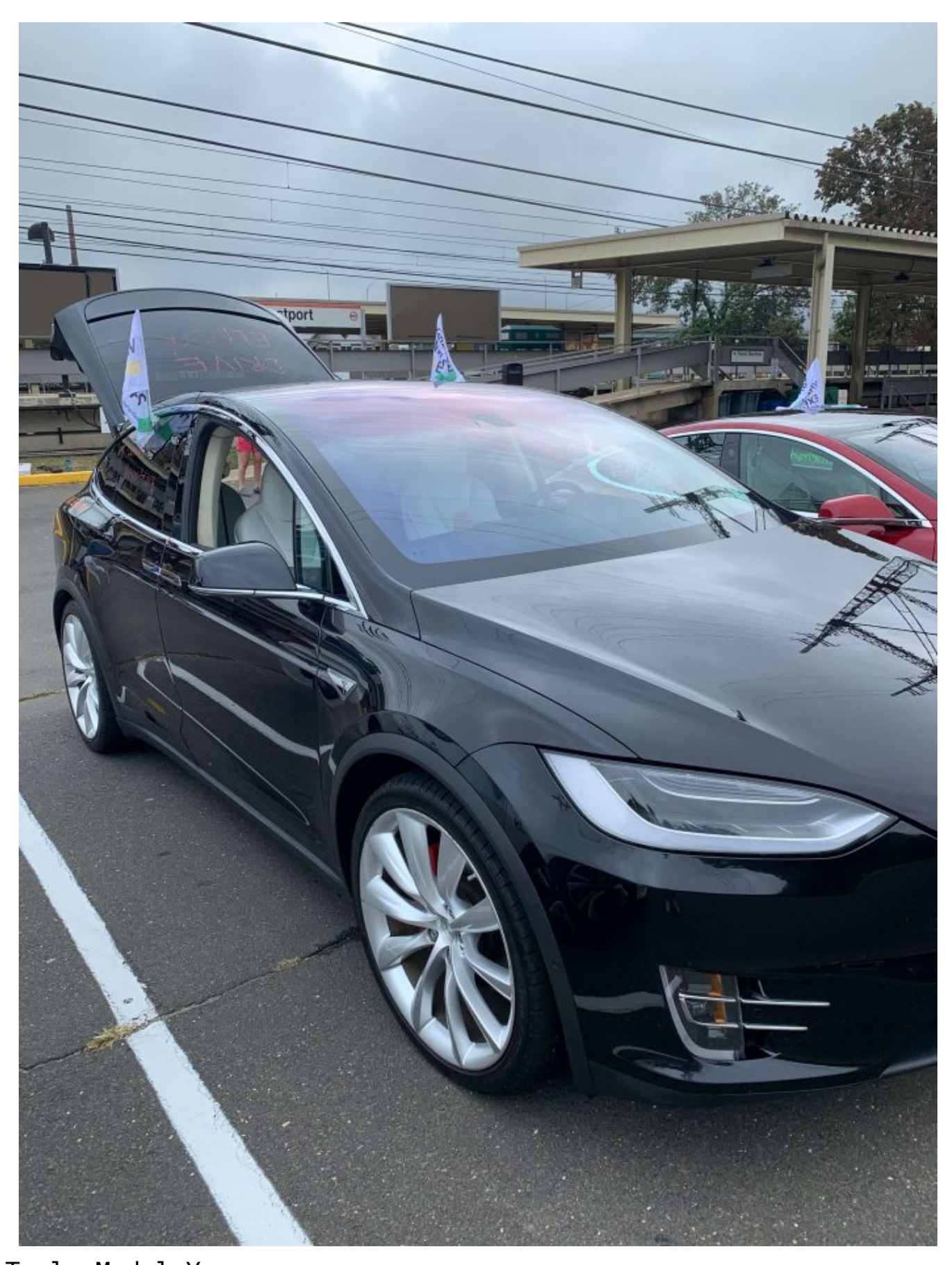
Tesla Model Y