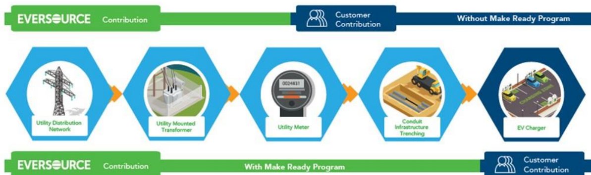
Figure 1 Eversource's Proposed Make-Ready Investment Model

Eversource RFPD Response, Exhibit 2, p. 8.